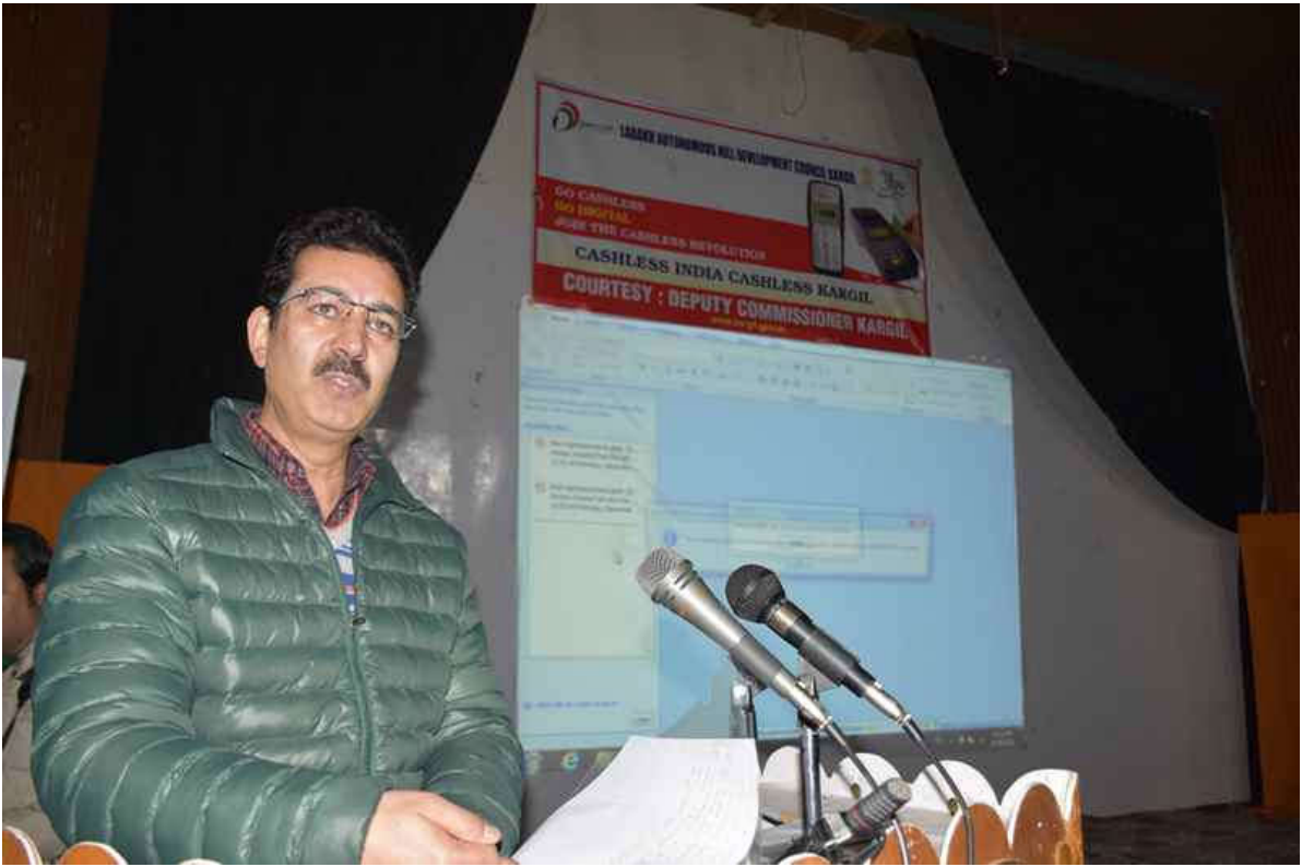
JK Bank manager explaining ways of payments