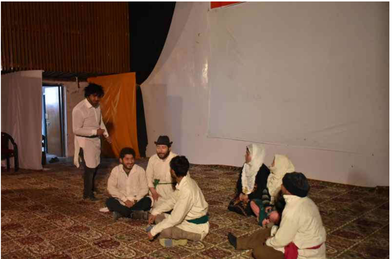
Educating People through Drama Play.