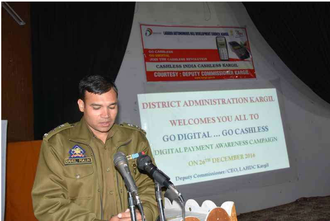
SSP Kargil addressing the attendees.