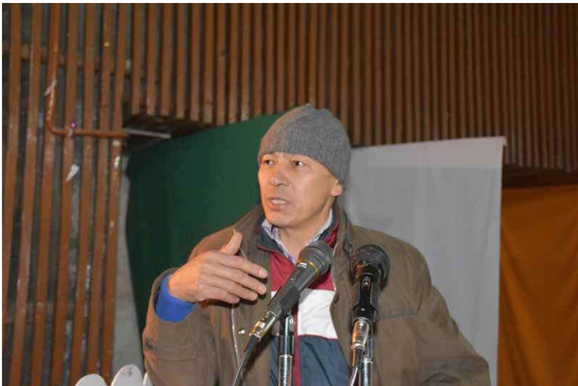
DIO NIC delivered power point presentation on demonetization.