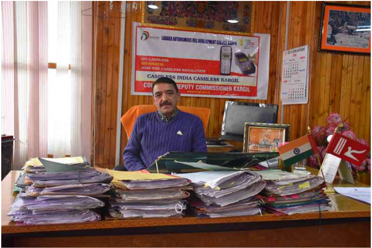
Deputy Commissioner/CEO, LAHDC Kargil Chambers