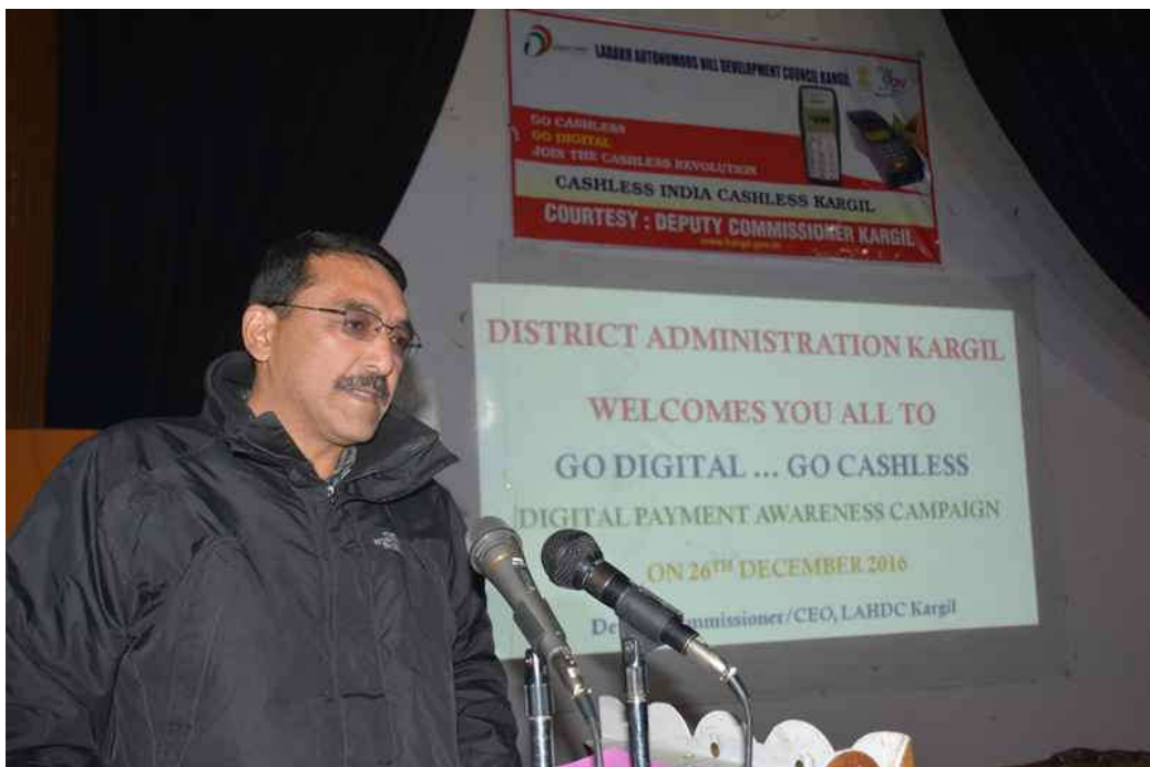
Deputy Commissioner/CEO, LAHDC Kargil motivating the Audience.