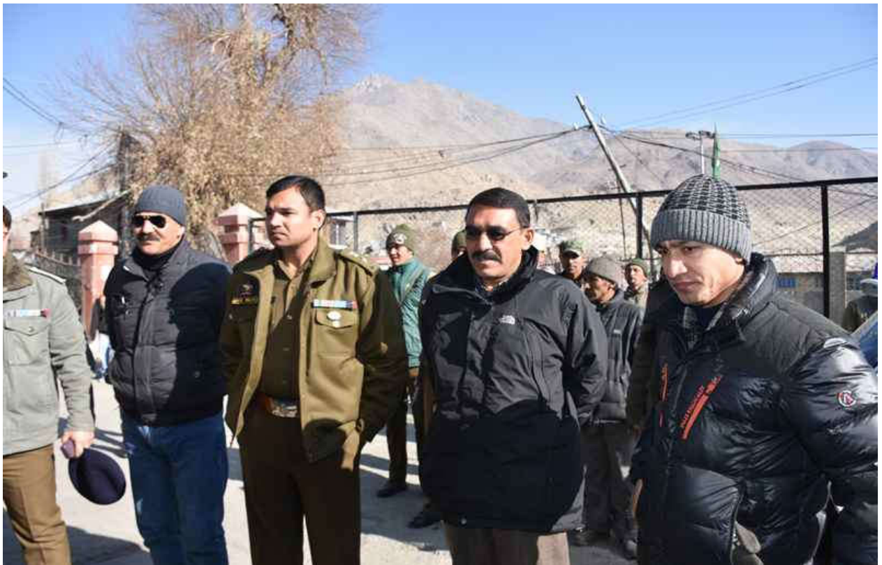
Deputy Commissioner/CEO, LAHDC Kargil with SSP Kargil arrive at venue