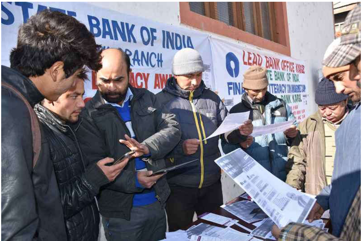
People learning from stalls provided by various banks