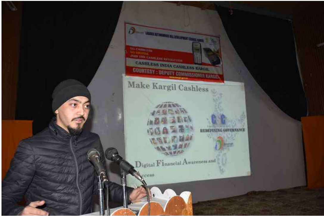
District Manager, CSC gave a Presentation of the Digital Payment systems