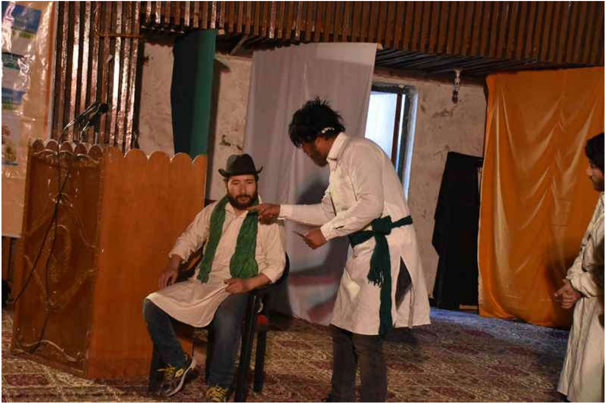
A performance by Ranthak Group Kargil