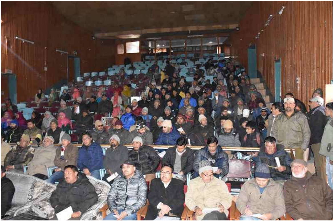
Audience at Auditorium Hall