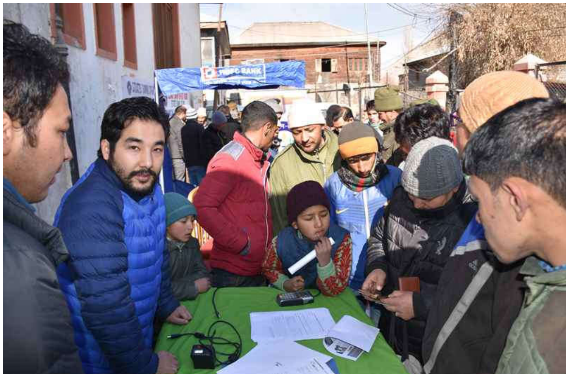
Registering mobile numbers for digital payments