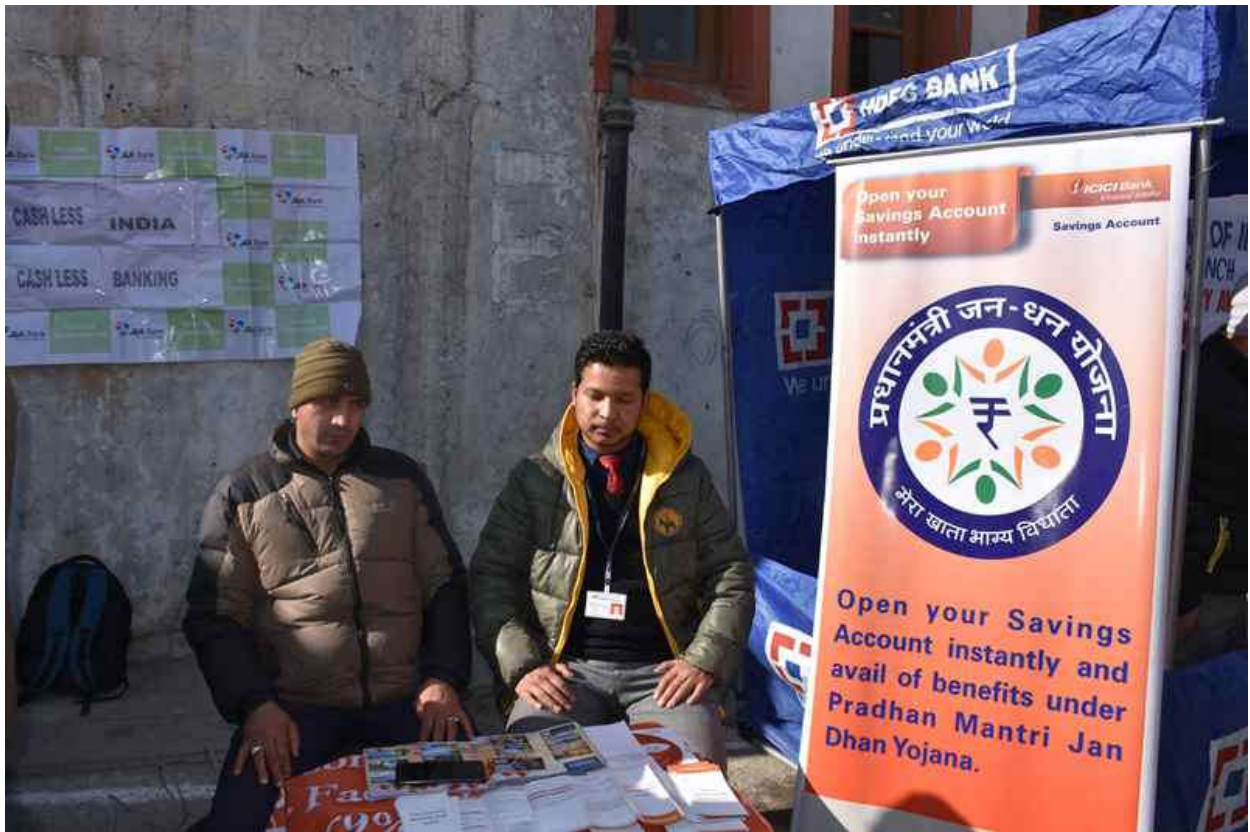
Banking Stalls by Banks