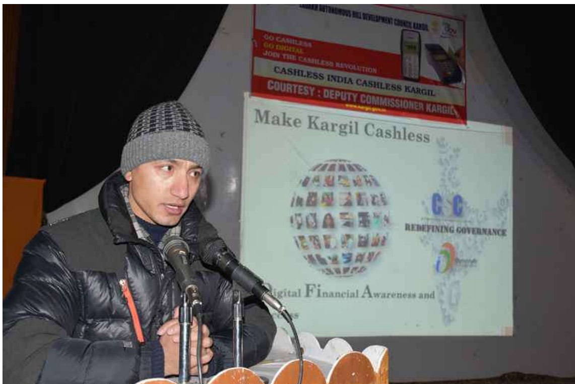
Headquarter Assistant to Deputy Commissioner Kargil Giving Introductory Speech