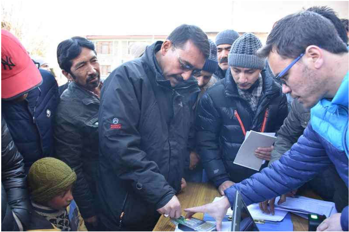
DC Kargil Using Aadhar enabled Payments System to encourage new digital payment systems.